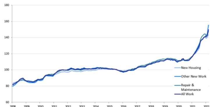
Chart 1: Construction Material Price Indices, UK Index, 2015 = 100