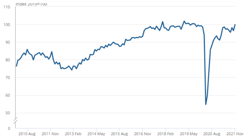
Monthly all work index, chained volume measure, seasonally adjusted, Great Britain, January 2010 to November 2021