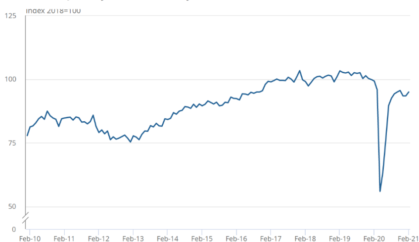
Monthly all work index, chained volume measure, seasonally adjusted, Great Britain, January 2010 to February 2021